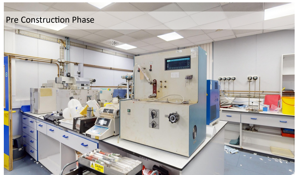
Pre Construction Phase