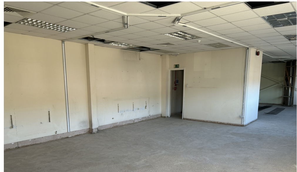
Pre Construction Phase